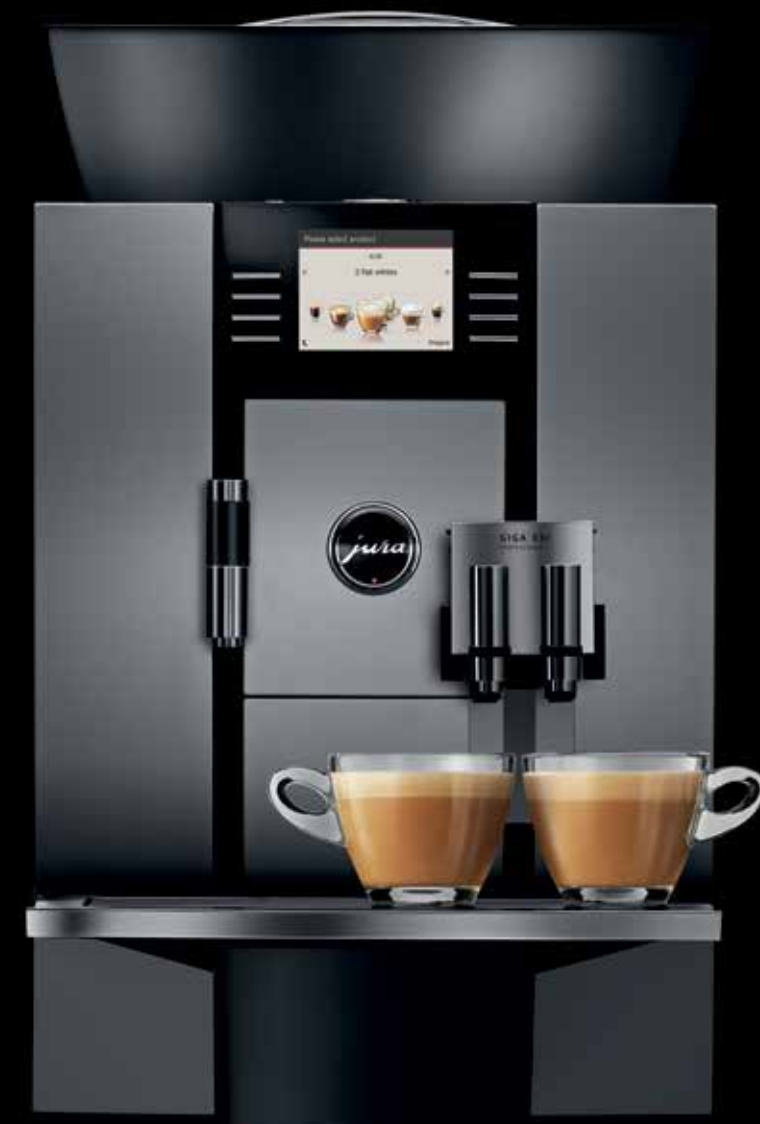
GIGA X3c Professional

With a wide selection of accessories including a cup warmer, milk cooler, coffee grounds disposal function set and interface for accounting systems, as well as an attractive range of storage and presentation units, it is possible to create a complete coffee solution tailored to your specific requirements.