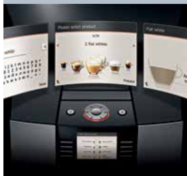
Customisable start screen