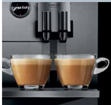
Variable dual spout with 2 coffee spouts and 2 milk spouts