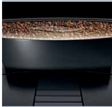
Professional ceramic disc grinder